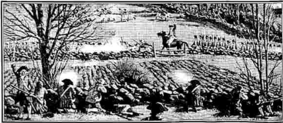
Major Pitcairn (mounted) leading his command back to Boston

Project Gutenberg Etext of THE ONLY WOMAN IN THE TOWN